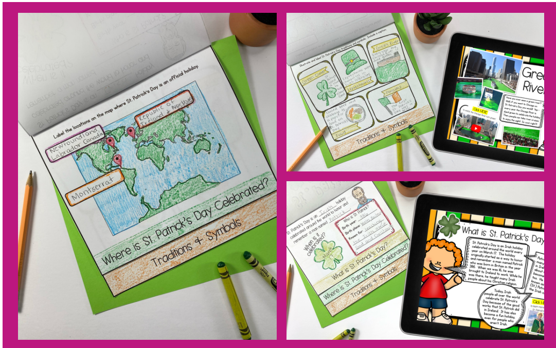
Answer Key & Rubric