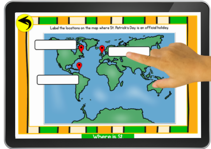
Digital Flipbook for LINKtivity in Google Slides